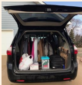
Stopped for now