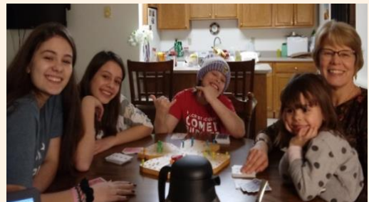
Sheltered-in-place with grandchildren