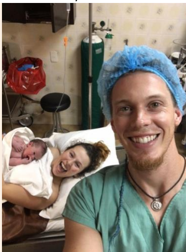
Victorious after a hard labor!